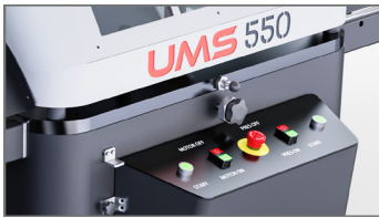
Double Hand Control