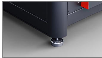
Rubber Vibration Feet