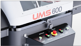
Double Hand Control