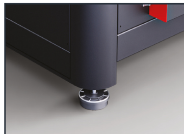
Rubber Vibration Feet