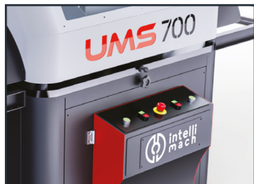
Double Hand Control